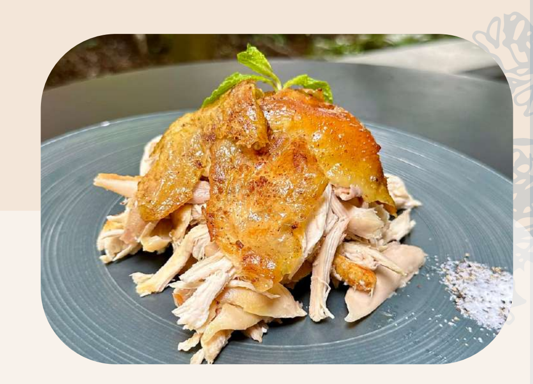
Salt Baked Chicken 烤咸鸡