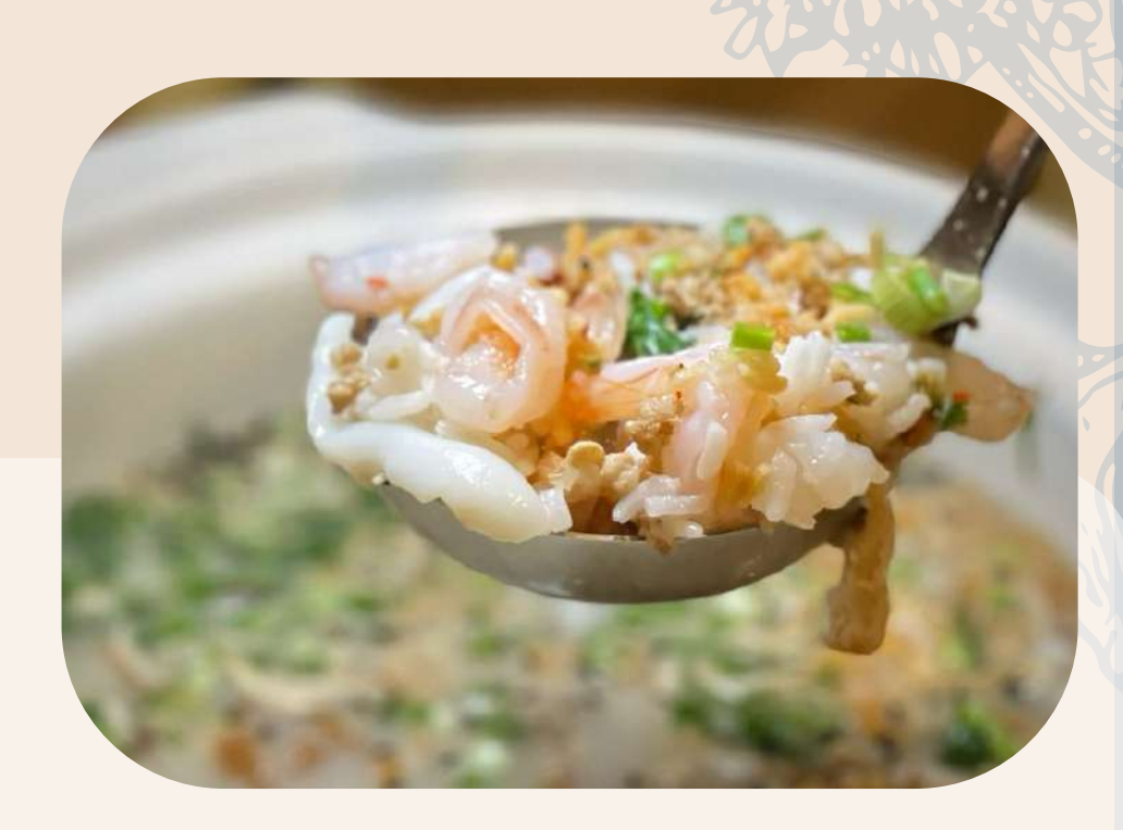
Superior Fish Soup With Diced Prawns, Cuttlefish, Minced Pork And Crispy Rice 私房肉碎海鲜脆米鱼汤泡饭