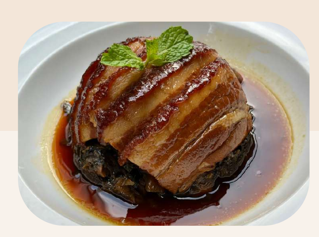
Hakka Dongpo Pork Belly With Mei Cai 客家梅菜东坡肉