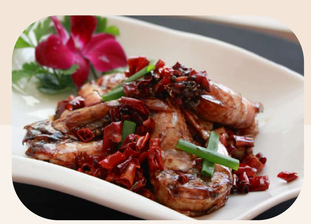
Fried King Prawns With Chilli And Crispy Garlic 避风塘翻炒黑虎虾