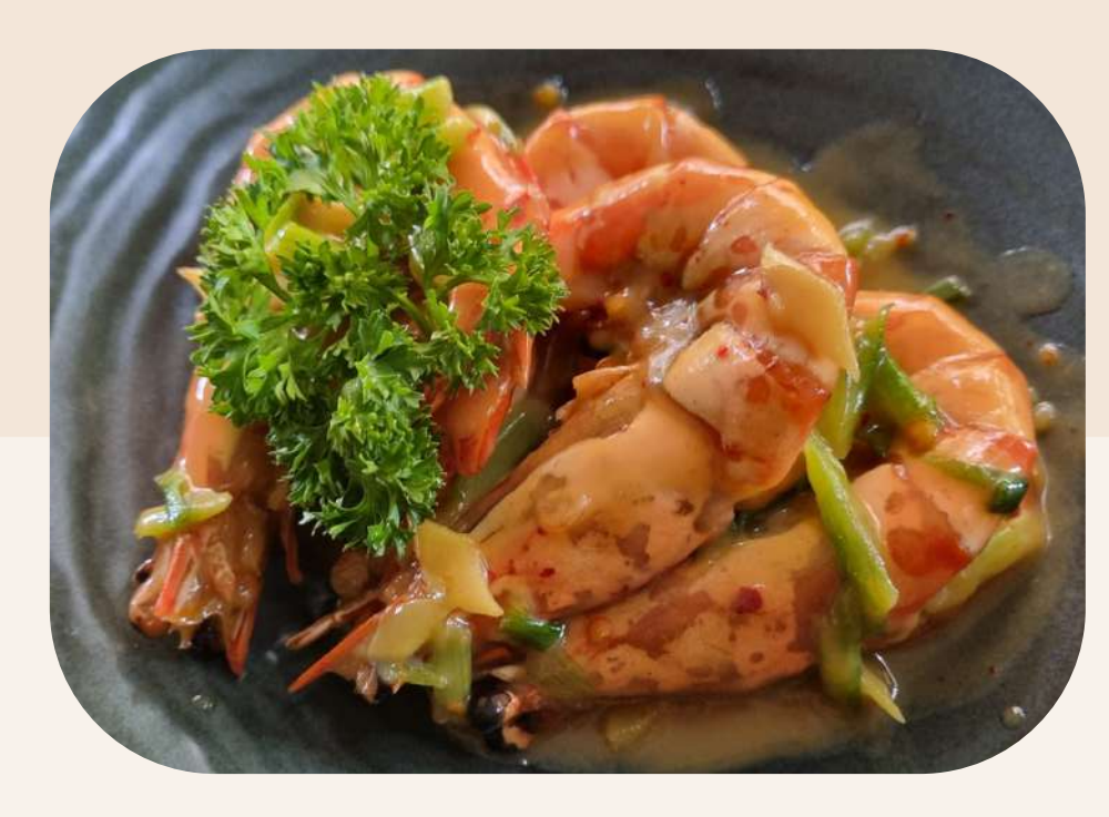
Prawns In Fermented Bean Curd Miso Sauce 香辣姜葱腐乳炒虾