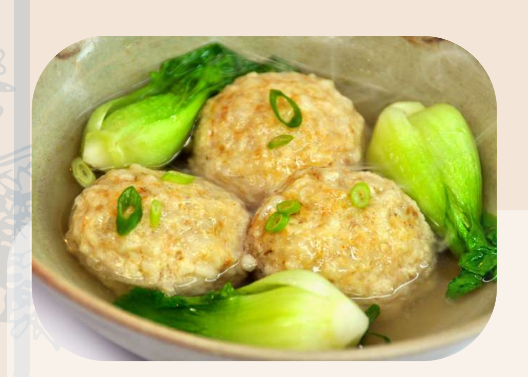
Lion's Head Consomme 私房狮子头