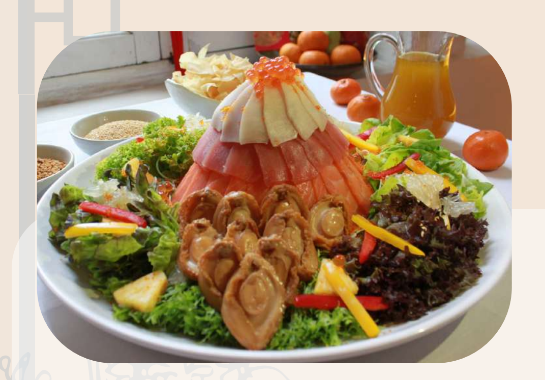
Signature Triple Prosperity Yu Sheng 囍宴招牌三宝发财鱼生