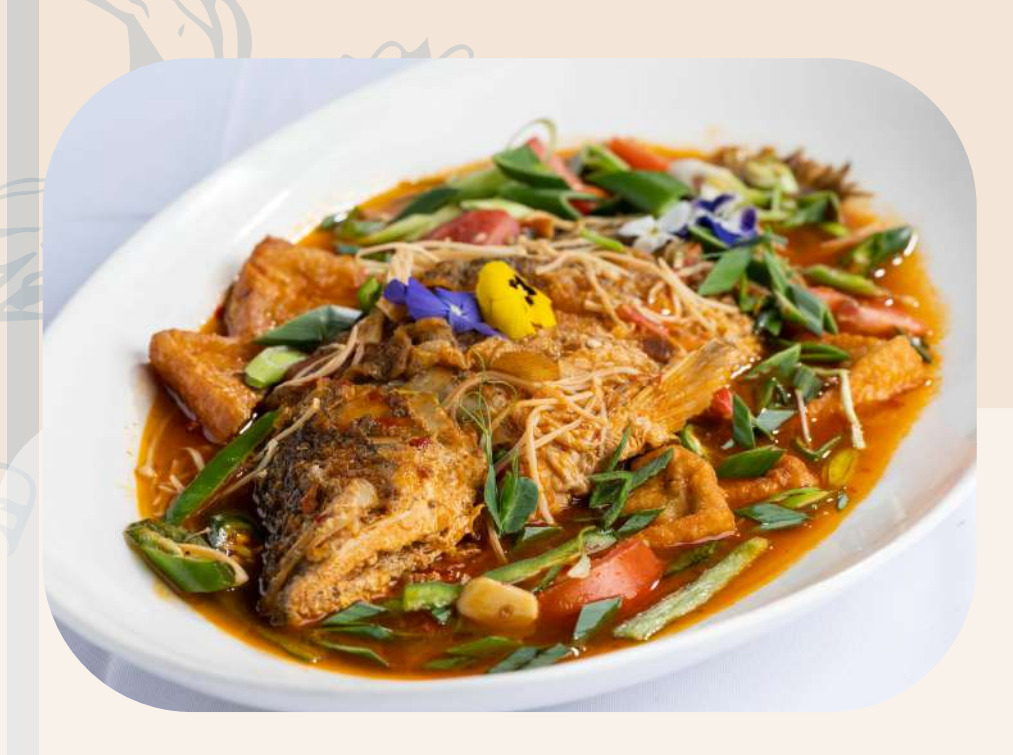
Grilled Grouper In Tangy Tomato And Beer Broth With Enoki And Tofu Puff 啤酒 番茄烤鱼