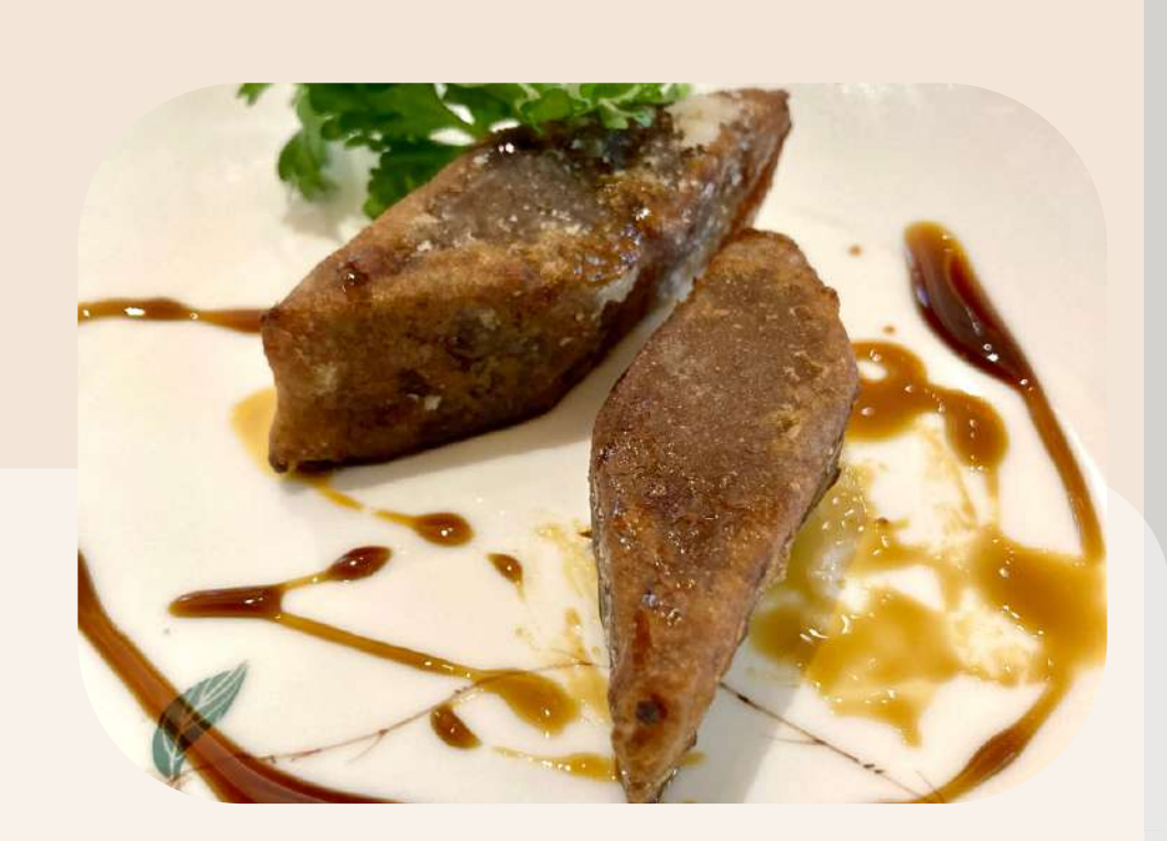
Pan Fried Homemade Gula Melaka Nian Gao 黑糖年糕

Note: Prices stated are per pax and subjected to prevailing GST & 10% service charge. Reservation is strongly encouraged especially during peak CNY days. Menus may be subjected to changes it our chefs believe that certain ingredients available for the day are not as satisfactory for serving.